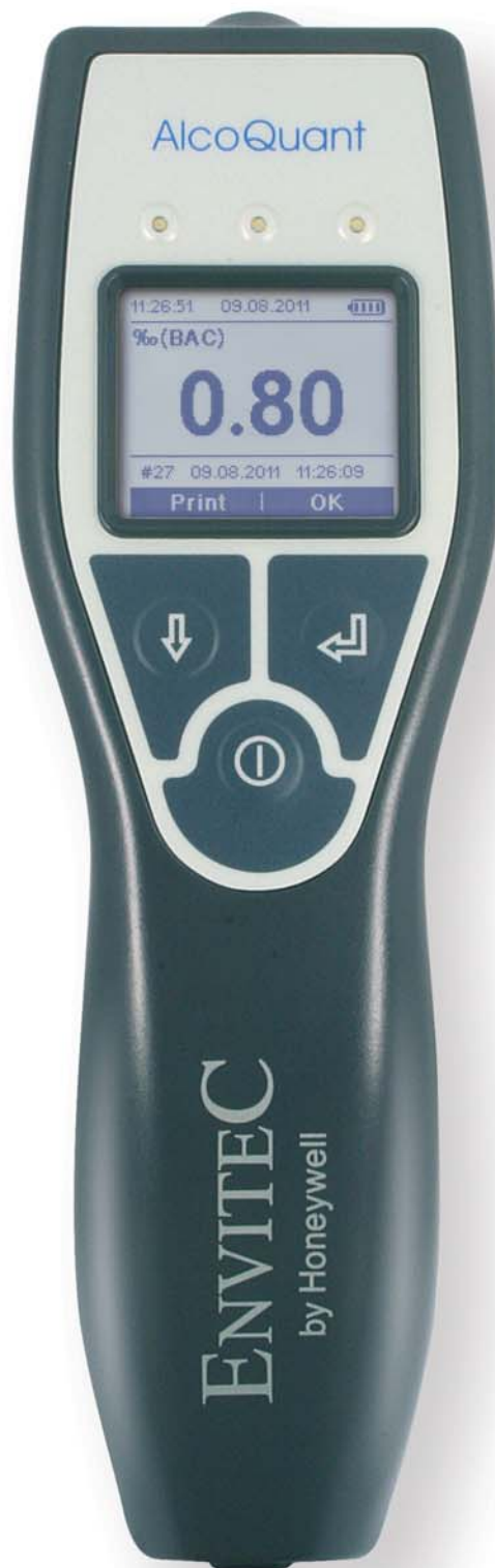
Device in original size